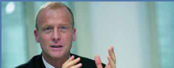
Thomas Enders Chief Executive Officer

Mr Enders joined MBB/Dasa AG in 1991. After several years in the company's marketing sector, he became Corporate Secretary of Dasa AG in 1995. From 1996 he was in charge of Corporate Strategy & Technology and from 2000, he was the Head of Defence & Security Systems Division. In June 2005, he was appointed Chief Executive Officer of EADS. Mr Enders holds degrees from the University of Bonn and UCLA, California.